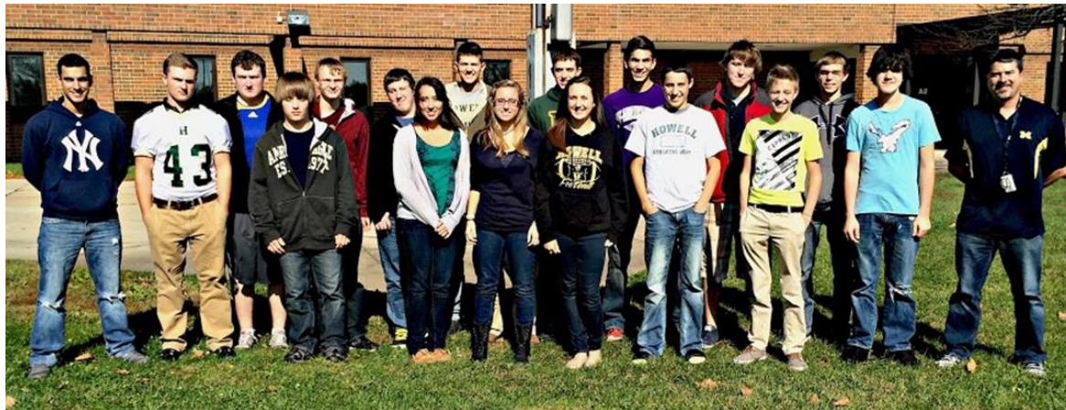
Inaugural Private Pilot Ground School Class – Fall 2013